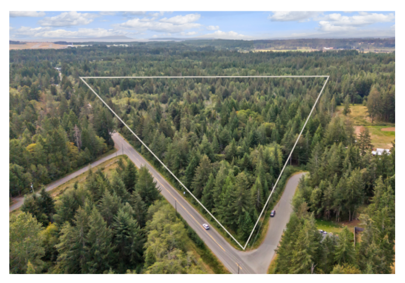
*All lot lines are approx., please verify if important.